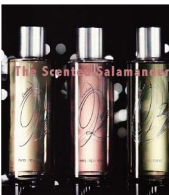
Thanks to TheScentedSalamander

All fragrances are signed by Jean Paul Guerlain .